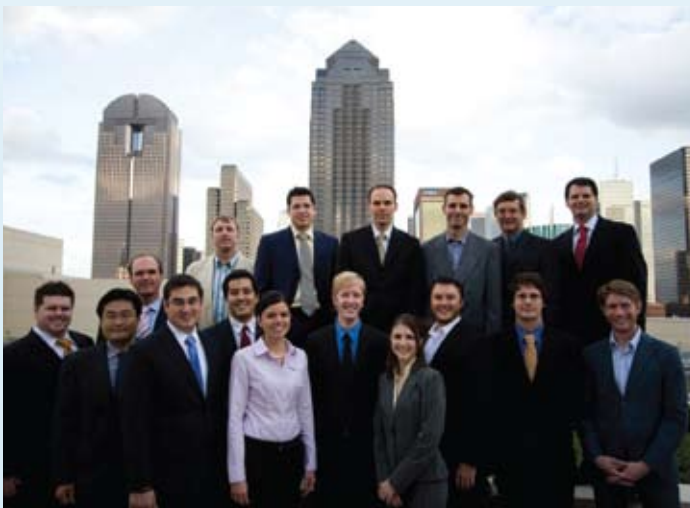
Certificate Students class of 2009

ONE DAY A WEEK INTENSIVE, FOCUSED CURRICULUM