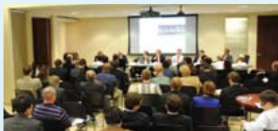
Our thanks to UTA Roundtable Reception sponsors HFF and Granite Properties.