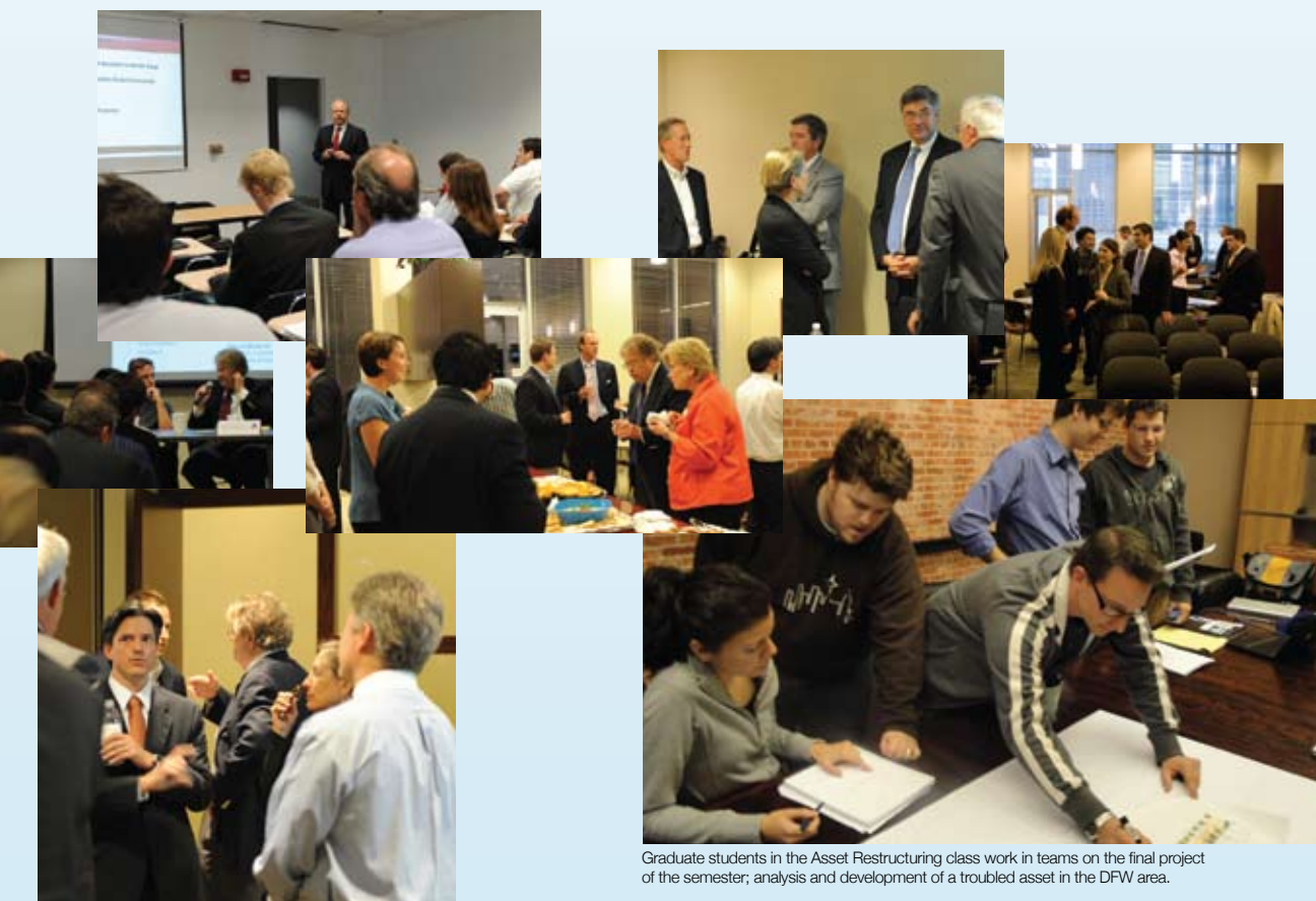
Graduate students in the Asset Restructuring class work in teams on the final project of the semester; analysis and development of a troubled asset in the DFW area.

ONE DAY A WEEK INTENSIVE, FOCUSED CURRICULUM