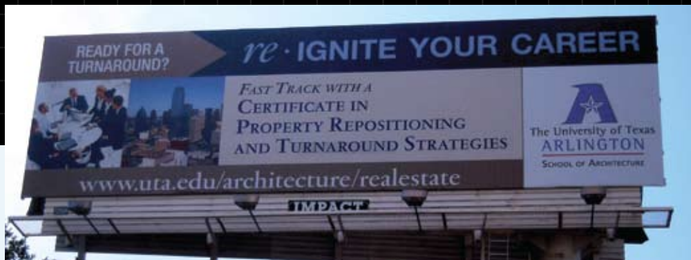
UTA Billboard at 1-35 and Oaklawn, the first-ever super-sized advertisement for the Asset Repositioning & Turnaround Strategies Program, appropriate for the first-ever such program in the country